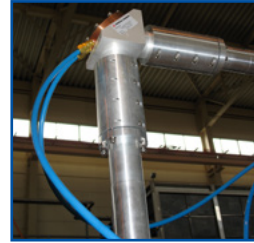
2.5" plain miter bend showing water cooling lines to copper mirror