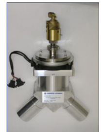
2.5" polarizer miter bend showing water connection for mirror cooling