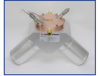
Arc detector version in 2.5" waveguide showing optical fiber connections