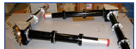
Pair of low diffraction miter bends