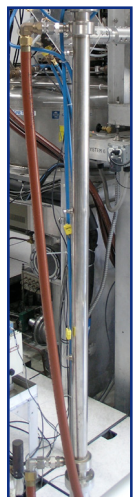
At left, absorbing waveguide sections and water jacket. At right, load installed for operation