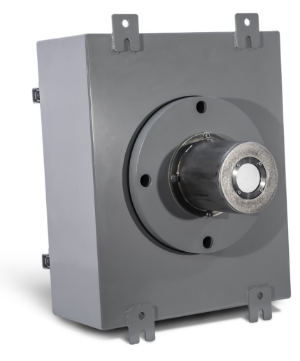
In-Duct Noble Gas Detector