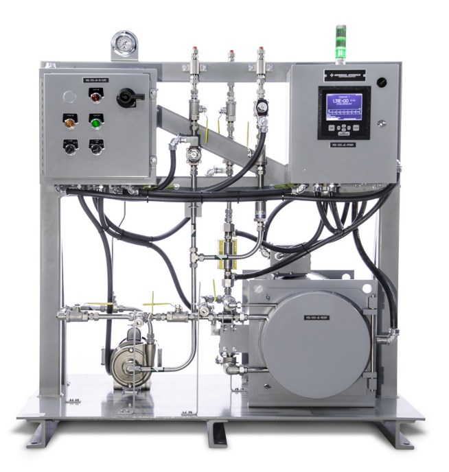
Off-Line Liquid Monitor