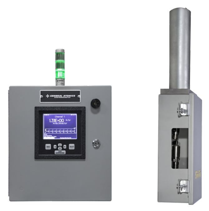
High Range Containment Monitor with RM-2020 AND RD-23 Detector

GA-EMS offers a variety of area monitors designed to continuously monitor gamma radiation for areas inside a nuclear power plant. Systems are configured to monitor low radiation ranges for the protection of plant personnel, as well as high radiation ranges to detect breaches in process stream or containment boundaries. GA-EMS area monitors feature Geiger-Mueller (G-M) tubes for low range gamma radiation detection and ionization chambers for high range gamma radiation detection. Extended range configurations are available to monitor ranges that overlap between the G-M tube region and ion-chamber region. GA-EMS microprocessor unit processes the detector signals, calculates activity data, displays data, transmits data to plant computer systems, and activates local and remote audible and visual alarms.