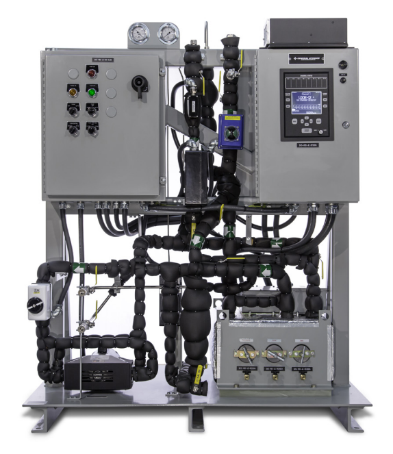
Heat Traced Particulate, Iodine, and Gas Monitor

GA-EMS radiation monitors include local processors, remote indicators, and integrated systems to perform data acquisition, analysis and display, monitor control functions, alarm relays, analog outputs, and digital communications. System databases contain operation and calibration constants, alarm set-points and history files, and are programmable for specific applications. The Control Room Display assembly provides easy menu-driven access to database items, monitor remote control and display, and continuous polling for radiation level and operation status. Operators can also perform control functions such as purge, checksource, and pump functions from the display to verify performance and status.