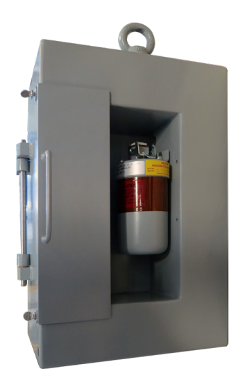
Adjacent-to-Line Detector in Lead Shield

Depending on the system configuration, detectors are protected by a three or six inch lead shield assembly to minimize any background radiation from reaching the detector. A shielded door provides easy access to the detector. GA-EMS monitoring systems are configured to fit most pipe and cable sizes to eliminate the need for additional engineering costs and to simplify installation and maintenance.