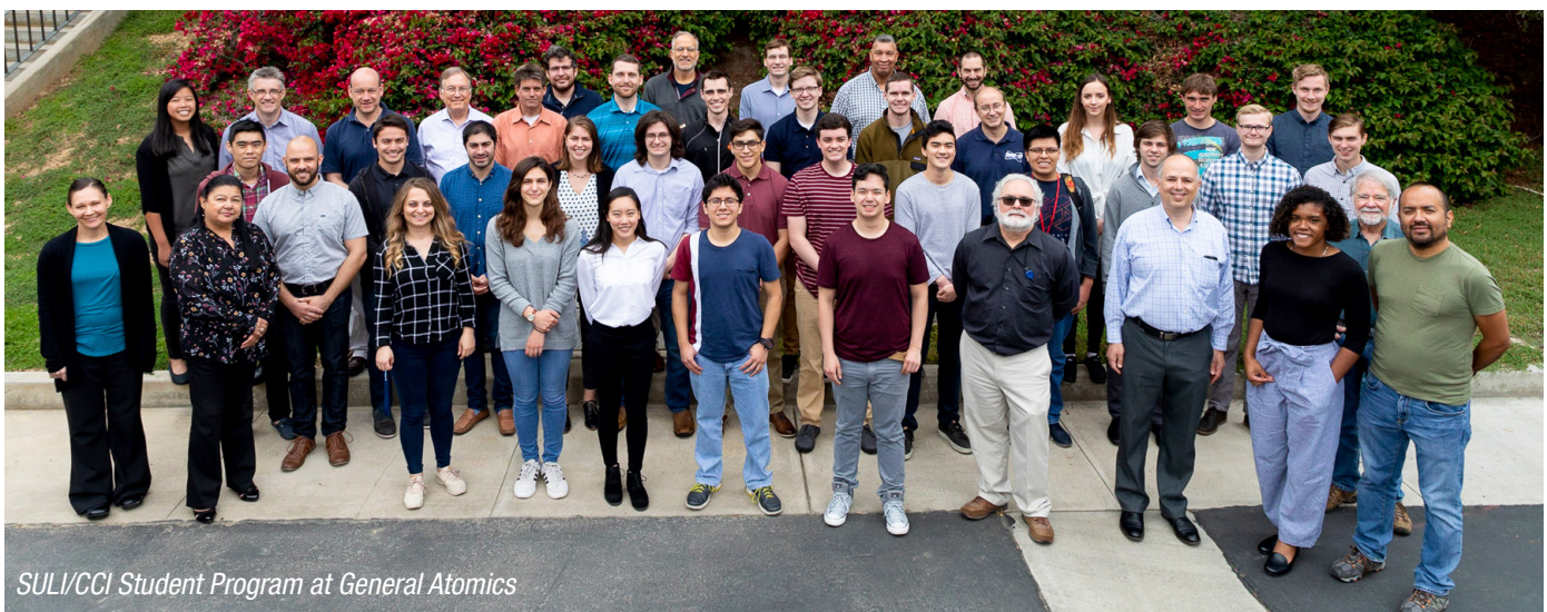
SULI/CCI Student Program at General Atomics