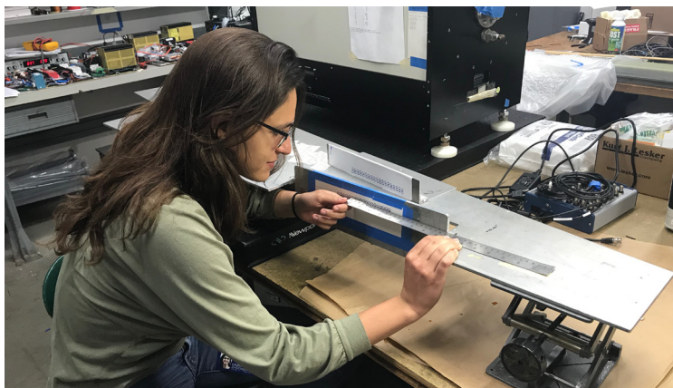
SULI student checks the spatial calibration of a charge exchange recombination spectroscopy system, as part of research into 3-D effects on plasma equilibrium

For more FAQs visit: https://science.osti.gov/wdts/suli & https://science.osti.gov/wdts/cci