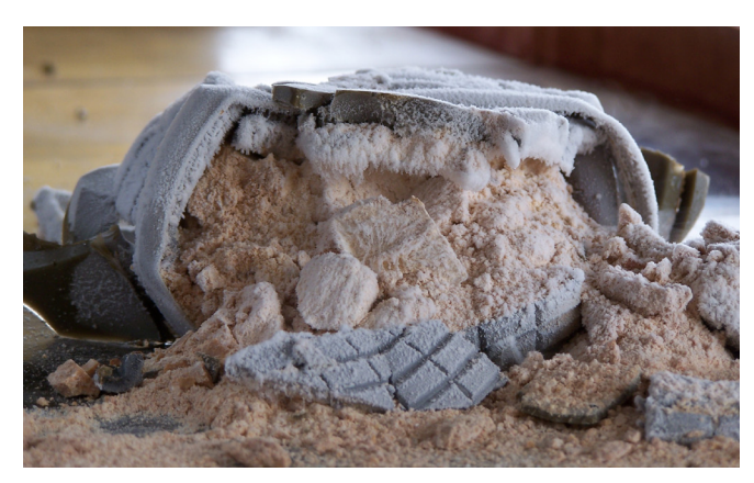
BLU 61A/B (CBU 51B/B) post cryofracture processing