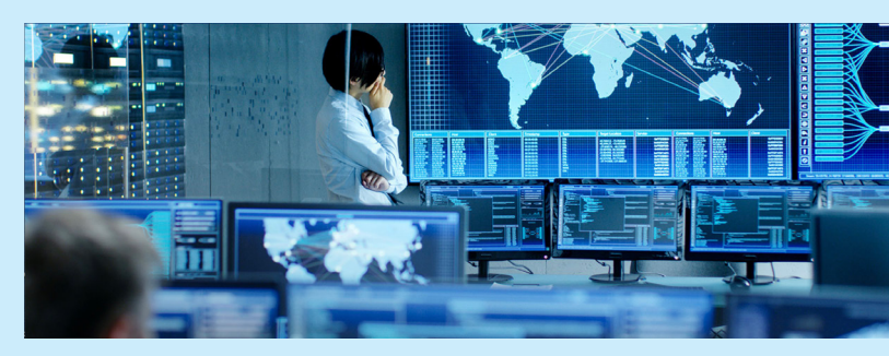
See our website for an <u>announcement</u> regarding the SolarWinds compromise and how to take steps to protect your enterprise.

GA is required to gather representation from our Suppliers on various topics. Some upcoming topics include compliance with <u>section 889 of the National Defense Authorization Act (NDAA) for FY 2019</u>, and which Suppliers qualify as <u>Non-Traditional Defense Contractors</u>. Take a moment to review these regulations in advance and verify your status. See your Purchasing Representative with any questions.