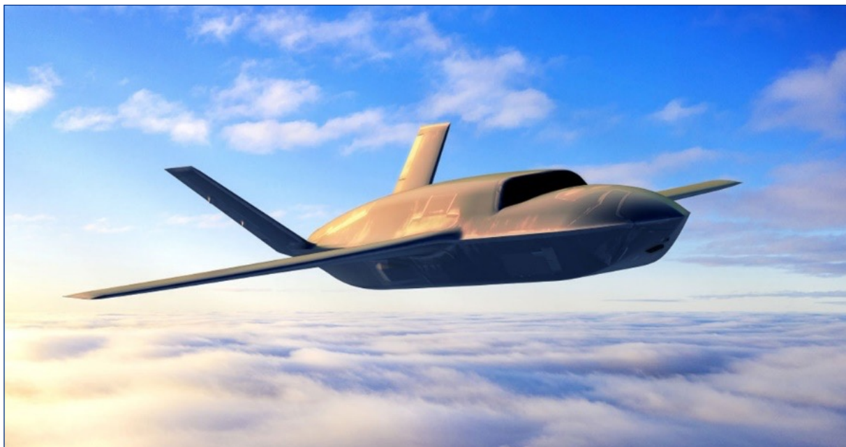
Collaborative Combat Aircraft (CCA) for the U.S. Air Force Life Cycle Management Center (AFLCMC).