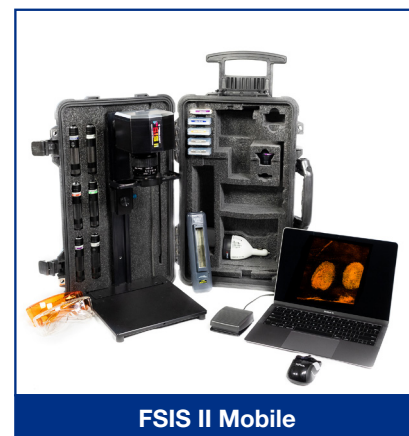
FSIS II Mobile