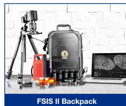
FSIS II Backpack