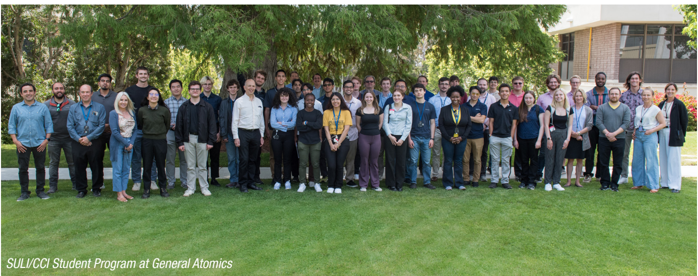
SULI/CCI Student Program at General Atomics