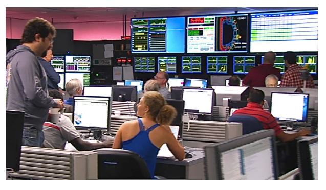
Students working in the DIII-D National Fusion Facility control room during experiments to advance fusion energy science

SULI/CCI offers selected applicants an opportunity to perform research under the guidance of laboratory staff scientists and engineers with sponsorship by the DOE.