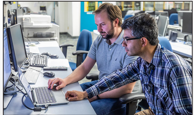
DIII-D National Fusion Facility researchers using machine learning to optimize plasma performance