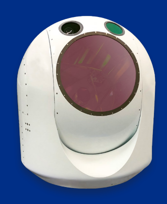
Compact Hemispherical Beam Director