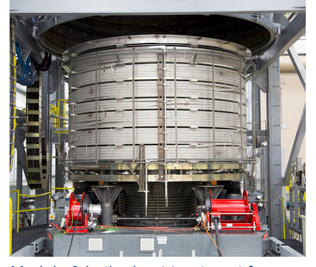
Module 2 in the heat treatment furnace