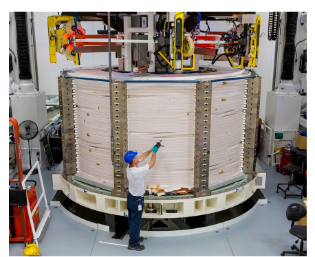
Turn insulation of module nearing completion