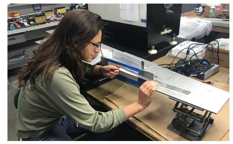
SULI student checks the spatial calibration of a charge exchange recombination spectroscopy system, as part of research into 3-D effects on plasma equilibrium

For more DOE SULI/CCI FAQs access: https://science.osti.gov/wdts/suli & https://science.osti.gov/wdts/cci