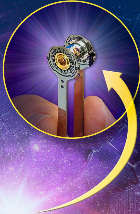
NIF Target Chamber with the Target Inserter/Positioner

Targeting Development in Fusion Research, Discovery Science and High Energy Density Physics