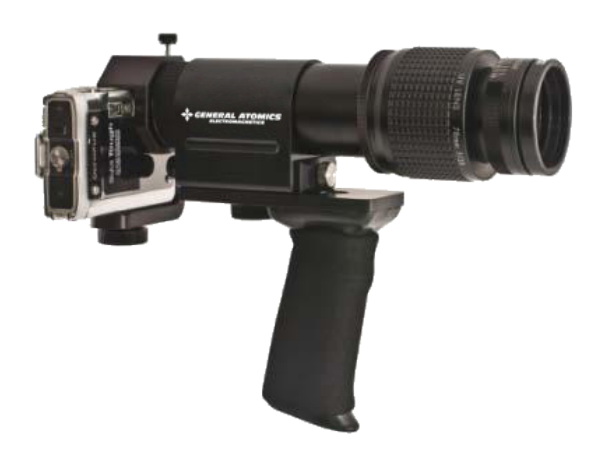
CoronaFinder with optional camera

CoronaFinder can be configured with an adapter to attach a variety of optional digital, CCD and digital video cameras to record and download images and video for review, annotation, reporting, and storage. CoronaFinder imagery can also be "zoom" viewed on the camera display.