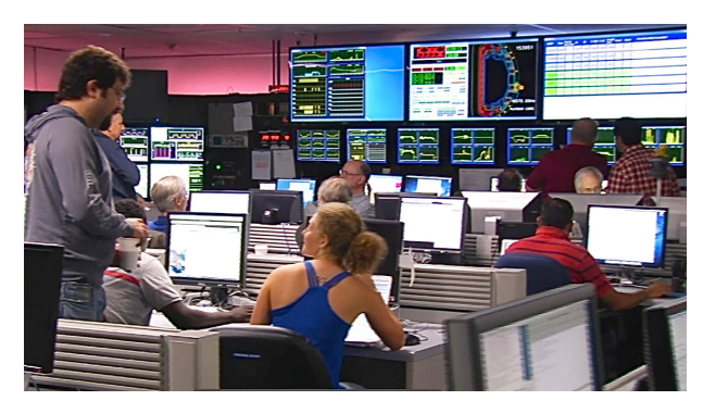
Students working in the DIII-D National Fusion Facility control room during experiments to advance fusion energy science

SULI/CCI offers selected applicants an opportunity to perform research under the guidance of laboratory staff scientists and engineers with sponsorship by the DOE.