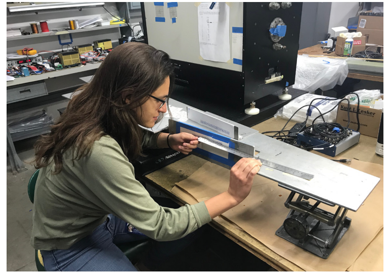
SULI student checks the spatial calibration of a charge exchange recombination spectroscopy system, as part of research into 3-D effects on plasma equilibrium

For more FAQs visit: https://science.osti.gov/wdts/suli & https://science.osti.gov/wdts/cci