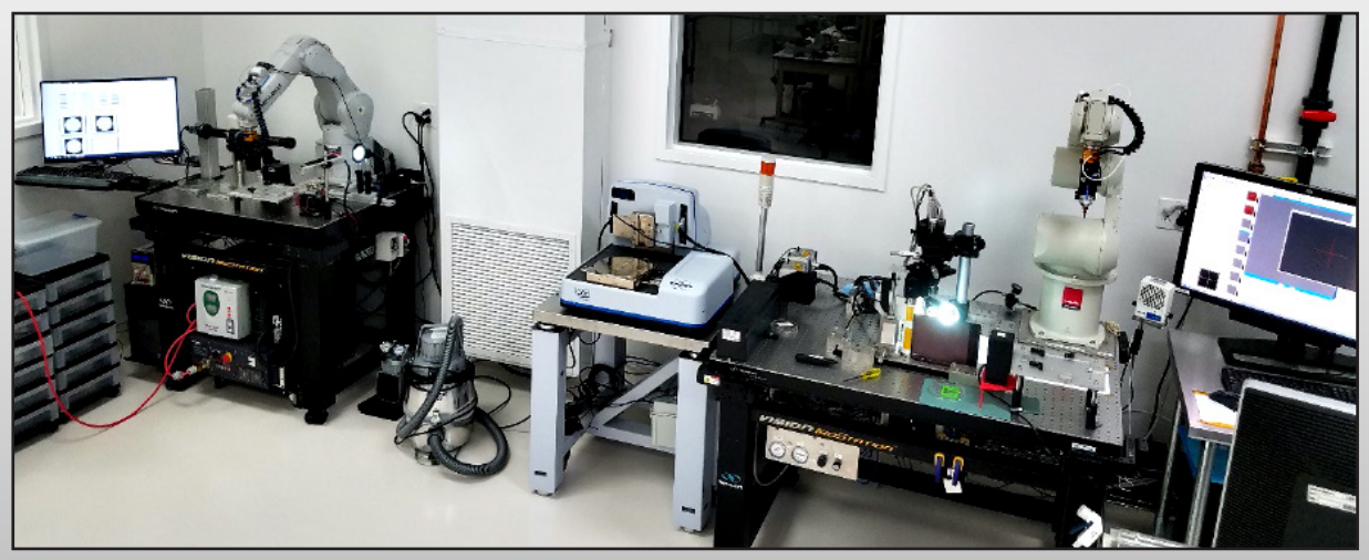
Automated shell characterization and sorting line uses machine learning