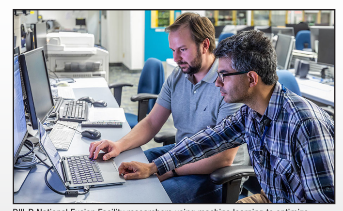
\mbox{DIII-D} National Fusion Facility researchers using machine learning to optimize plasma performance