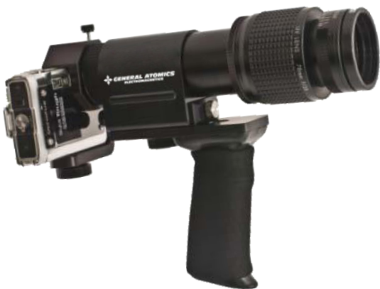
CoronaFinder with optional camera

CoronaFinder can be configured with an adapter to attach a variety of optional digital, CCD and digital video cameras to record and download images and video for review, annotation, reporting, and storage. CoronaFinder imagery can also be "zoom" viewed on the camera display.