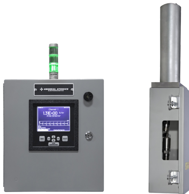
High Range Containment Monitor with RM-2020 AND RD-23 Detector

GA-EMS offers a variety of area monitors designed to continuously monitor gamma radiation for areas inside a nuclear power plant. Systems are configured to monitor low radiation ranges for the protection of plant personnel, as well as high radiation ranges to detect breaches in process stream or containment boundaries. GA-EMS area monitors feature Geiger-Mueller (G-M) tubes for low range gamma radiation detection and ionization chambers for high range gamma radiation detection. Extended range configurations are available to monitor ranges that overlap between the G-M tube region and ion-chamber region. GA-EMS microprocessor unit processes the detector signals, calculates activity data, displays data, transmits data to plant computer systems, and activates local and remote audible and visual alarms.