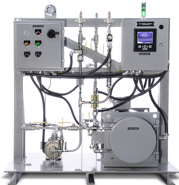
Off-Line Liquid Monitor