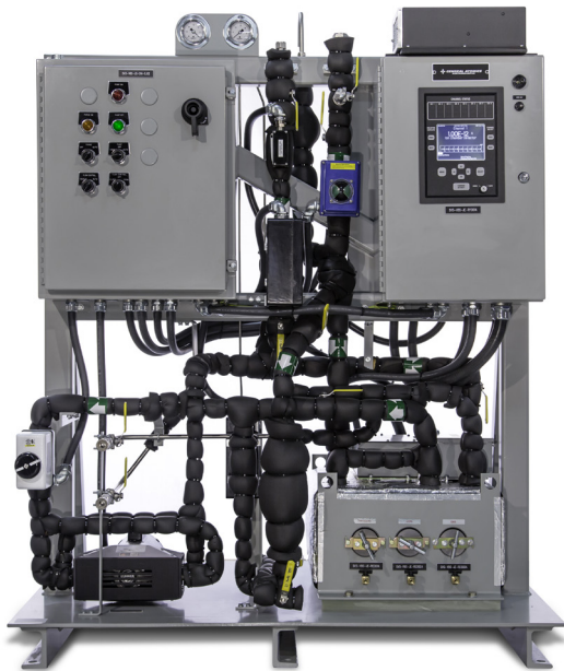
Heat Traced Particulate, Iodine, and Gas Monitor

GA-EMS radiation monitors include local processors, remote indicators, and integrated systems to perform data acquisition, analysis and display, monitor control functions, alarm relays, analog outputs, and digital communications. System databases contain operation and calibration constants, alarm set-points and history files, and are programmable for specific applications. The Control Room Display assembly provides easy menu-driven access to database items, monitor remote control and display, and continuous polling for radiation level and operation status. Operators can also perform control functions such as purge, checksource, and pump functions from the display to verify performance and status.