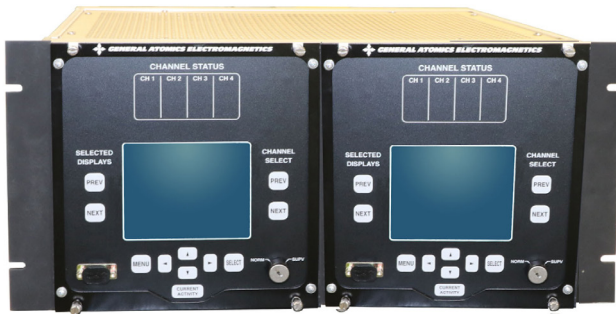
RM-2300 Dual NIM Bin