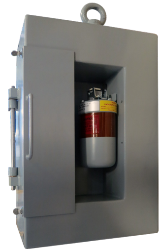
Adjacent-to-Line Detector in Lead Shield

Depending on the system configuration, detectors are protected by a three or six inch lead shield assembly to minimize any background radiation from reaching the detector. A shielded door provides easy access to the detector. GA-EMS monitoring systems are configured to fit most pipe and cable sizes to eliminate the need for additional engineering costs and to simplify installation and maintenance.