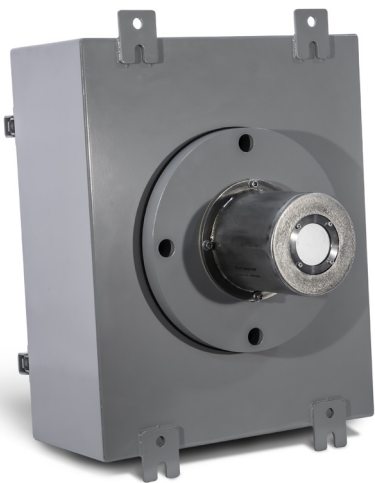
In-Duct Noble Gas Detector