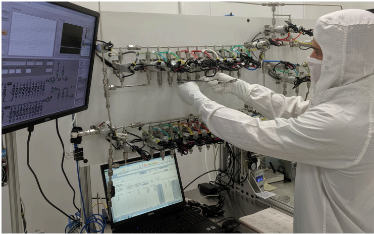
A SULI student adjusts an automated mass spectrometer system as part of his research in the Inertial Fusion Technology division

What should I expect from the mentoring relationship at the laboratory? All interns will be given ongoing technical guidance and advice. Interns participating in person will receive appropriate materials, equipment, technical and clerical support, and office space to perform research activities. Virtual interns will receive the appropriate equipment to support remote work. In all cases, interns can expect a professional and stimulating intellectual atmosphere.