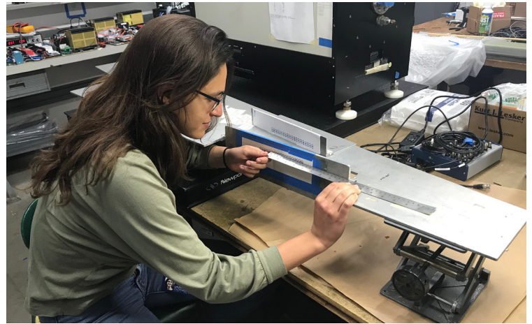
SULI student checks the spatial calibration of a charge exchange recombination spectroscopy system, as part of research into 3-D effects on plasma equilibrium

For more DOE SULI/CCI FAQs access: https://science.osti.gov/wdts/suli & https://science.osti.gov/wdts/cci