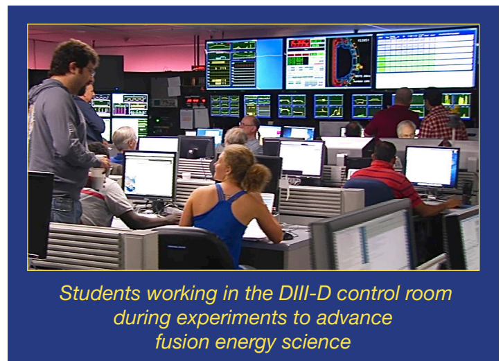
Students working in the DIII-D control room during experiments to advance fusion energy science

Location: DIII-D National Fusion Facility or GA's Inertial Fusion Technologies facilities, both in San Diego, CA. Remote participation from the intern's residence is also considered.